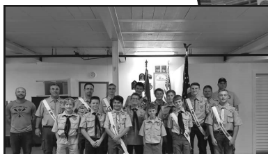
Our Chartered Scouts!